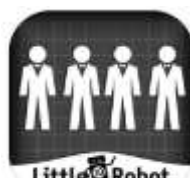
Operation Math Code Squad £2.99 (iOS) £2.69 (Google)