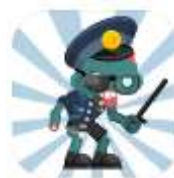
Math Vs Zombies Free (iOS) Free (Google)