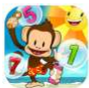
Monkey Math School Sunshine £1.99 (iOS) £1.79 (Google)